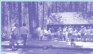
Nature oriented craft activities daily at the craft center.